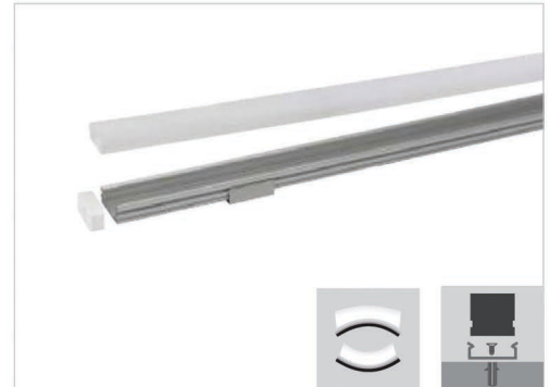
Silver Black White (ra9016)