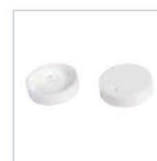
Hole: 30308 W/O hole: 30309